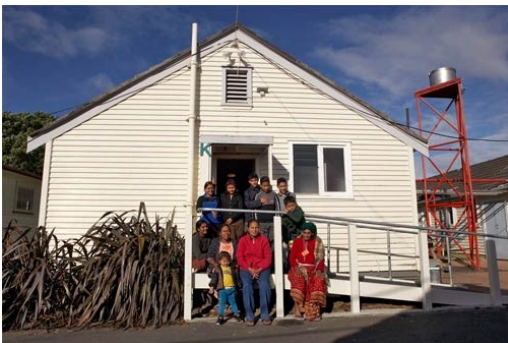
The Māngere Refugee Resettlement Centre in South Auckland processes and orientates Refugees prior to their resettlement in houses around New Zealand.